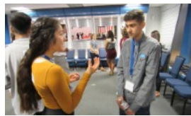
HSA LEARNS ABOUT LEADERSHIP REAGAN LIBRARY