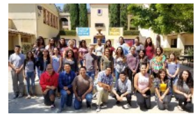
GUEST SPEAKERS VISIT HSA JUNIORS CAREER EXPLORATION