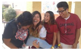
FRESHMEN MEET THEIR JUNIOR LINKS ACADEMY LINK